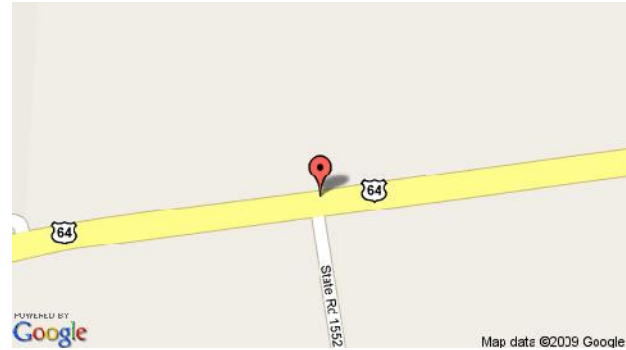
Street Map of Jamesville Industrial Park