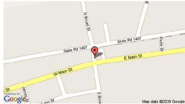
Street Map of Martin Regional Business Park